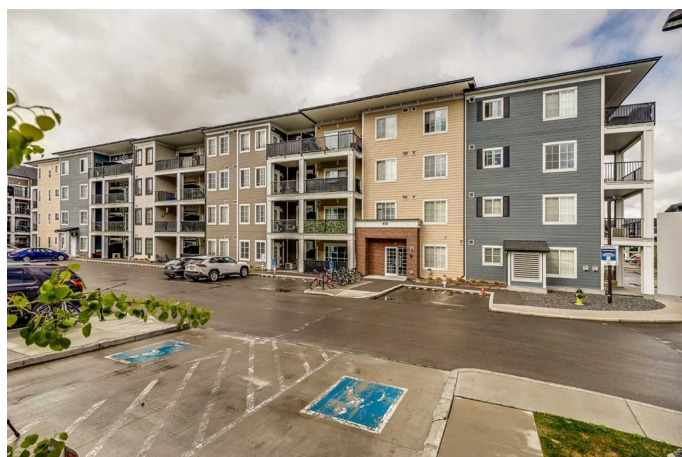
table for added convenience. This home also includes a titled tandem underground parking

laundry room adds practicality, with ample room to hang delicate items or set up a folding